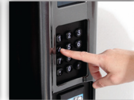
Large and easy to read selection buttons with Braille identification.