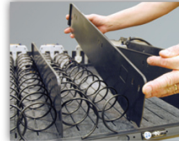
Re-configure trays to almost any package size in the field with no need for tools.