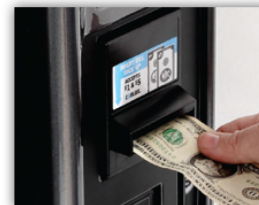
Premium Currency Acceptors

Keep your customers happy by with all their favorite chips, crackers, cookies, candy & confections.