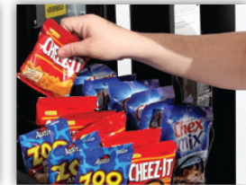
Dispenses All Brand Name Products

Keeps customers satisfied and reduces service calls for misloaded product.