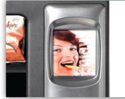
Back lighted point of sale window for advertising and specials.