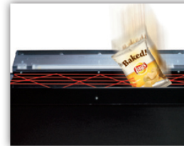
iVend® Guaranteed Delivery System

Keeps customers satisfied and reduces service calls for misloaded product.