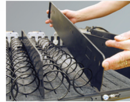
Re-configure trays to almost any package size in the field with no need for tools.