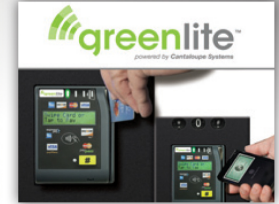
Credit/Debit & mobile reader options.