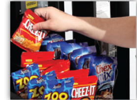
Dispenses All Brand Name Products

Keeps customers satisfied and reduces service calls for misloaded product.