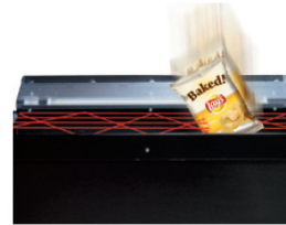
iVend® Guaranteed Delivery System

Keeps customers satisfied and reduces service calls for misloaded product.