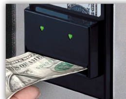
Premium Currency Acceptors

Keep your customers happy by with all their favorite chips, crackers, cookies, candy & confections.